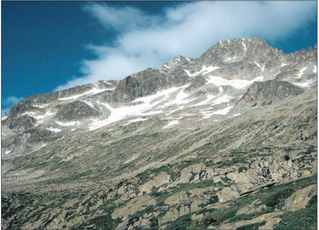
Fig. 8. Habitat of Psodos bentelii perlinii near Refugio Mandrone, Northern Italy, 9.vii.1994.

end of the antrum. Furthermore, the lateroventral part of lamella postvaginalis is more rounded in P. bentelii bentelii than in P. bentelii perlinii .